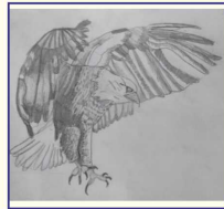
Akshara Subhash, 4C