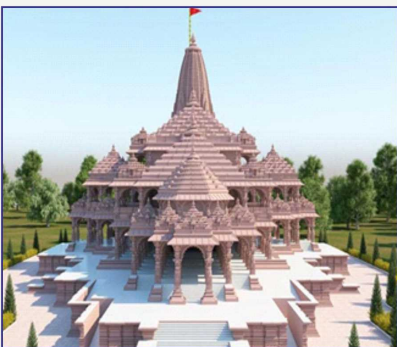
Values Plus Team

To emulate the celebratory mood of the subjects of Ayodhya in welcoming their beloved Shri Rama after his 14 years of exile, our honourable PM has called upon everyone to celebrate this significant day in a similar spirit, by lighting Diyas (lamps) in their homes, which should be reminiscent of Deepavali.