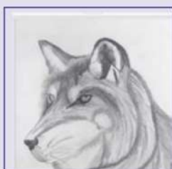
Sourish V, 7A