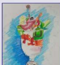
Akshara Subhash, 4C