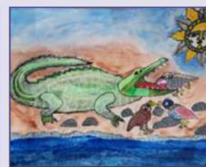
Suraj N, 7B