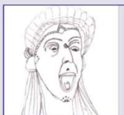
Monit V, 4E