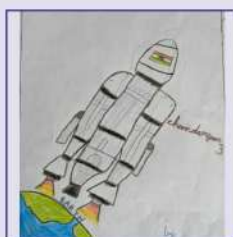
Sanjith Anulraj, 4D