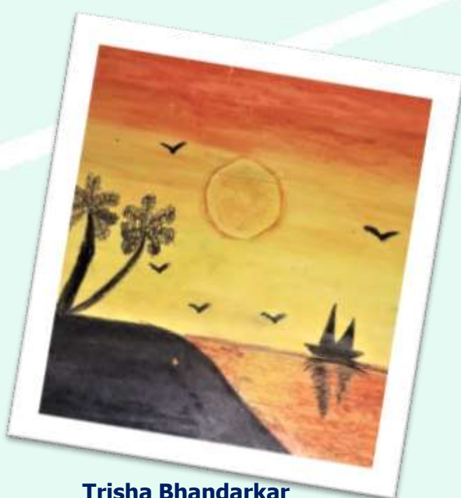
Trisha Bhandarkar 4 E