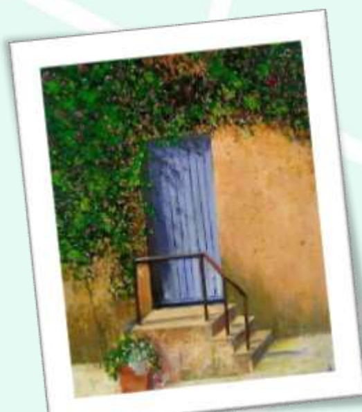
Mahi Gadi 9 C