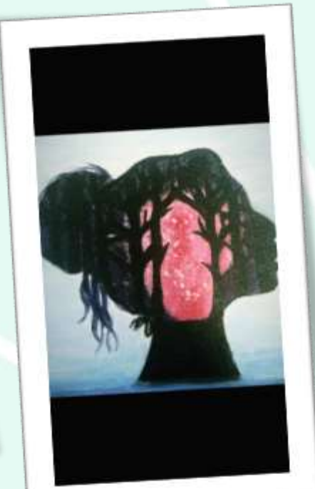
Mhithraa H 10A