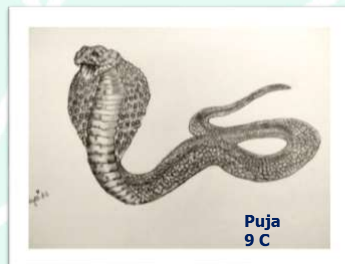
Puja 9 C