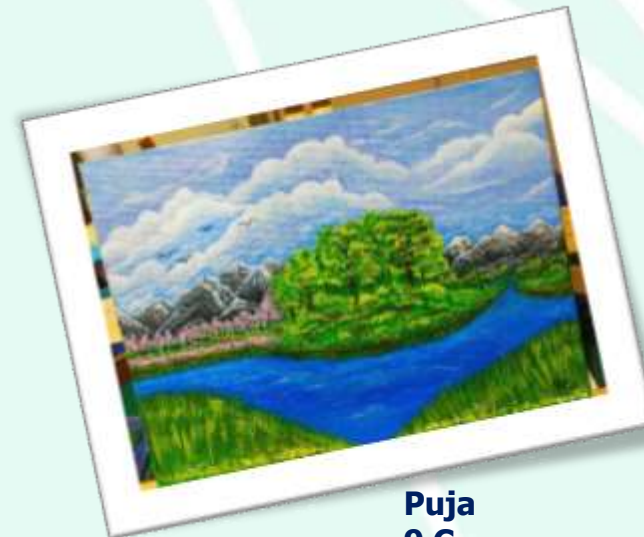
Puja 9 C