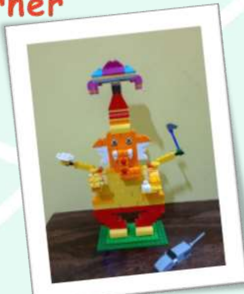
Shreyansh Pal 2 D