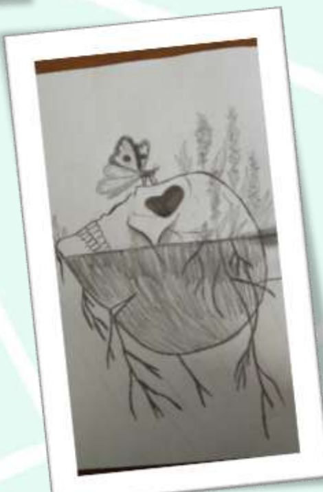
Neha 8 D