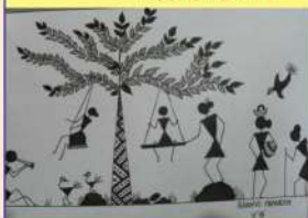
Saanvi Praveen, 5 B