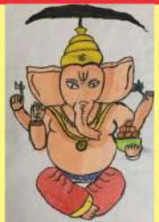
Vishnu Satish, 4 E