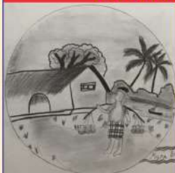
Myra Bhaya, 4 E