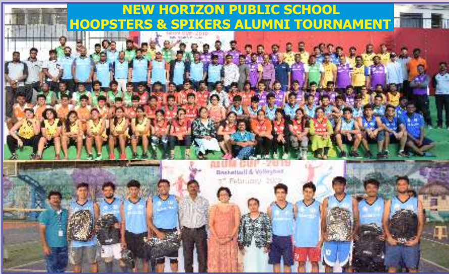
The ALUM CUP - 2019 - Basketball & Volleyball tournament was held on Saturday, February 2, 2019. 104 participants took part in the tournament.