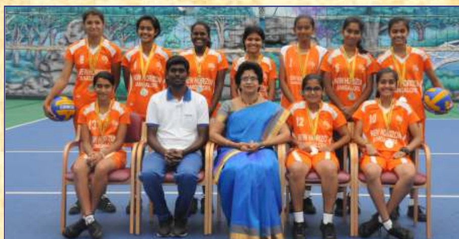
U-17 Volleyball Girls team secured the Runner Up in the Claret Cup conducted by St Claret School, Jalahalli