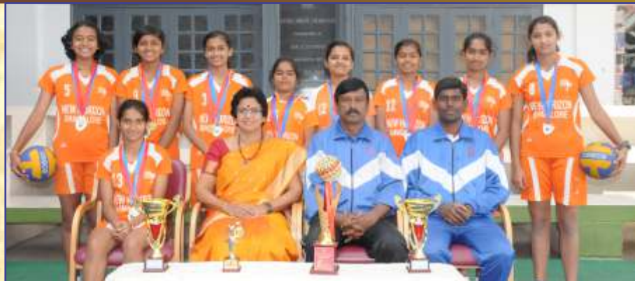
U-17 Volleyball Girls team secured the Runners Up trophy in the CISCE Karnataka Region Volleyball Tournament organised by B G S School, Chikkaballapur.