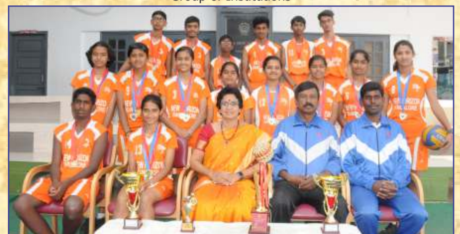
U-17 Volleyball Boys and Girls teams were Winners in the 16 th Mallappa Memorial Tournament conducted by Cauvery Public School, Sahakarnagar