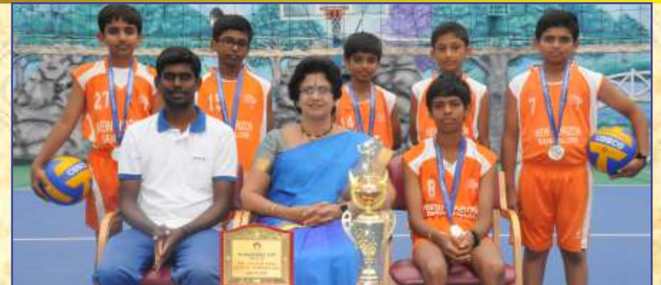
U-14 Volleyball Boys team secured the Runner Up in the 27 th Smt R A Devi Memorial Inter School Volleyball tournament conducted by Sri Kumaran's Group of Institutions