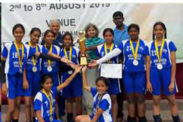
U-13 Girls Volleyball Runner Up