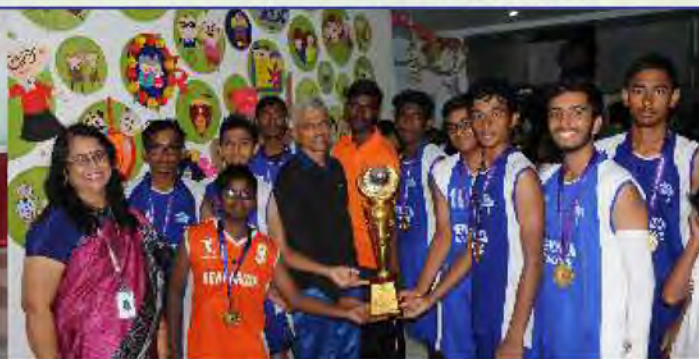
U-16 Boys Volleyball Winner