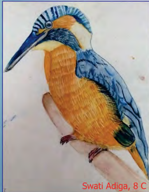
Swati Adiga, 8 C