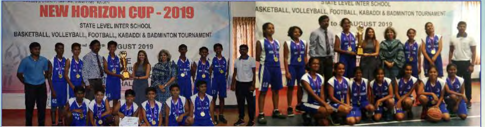
U - 14 BOYS BASKETBALL WINNERS

STATE LEVEL INTER SCHOOL BASKETBALL AND VOLLEYBALL TOURNAMENT FROM 2 nd to 8 th AUGUST 2019