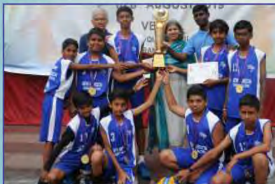
U-14 Boys Volleyball Winners

We hope to have a bigger and better tournament next year.