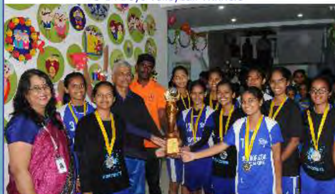
U-15 Girls Volleyball Runner Up