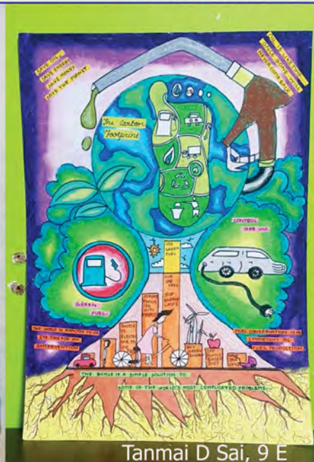
Tanmai D Sai, 9 E