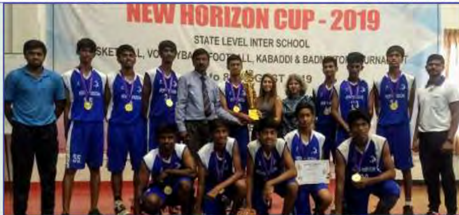
U - 16 BOYS BASKETBALL WINNERS

The 2019 State Level Inter School Basketball and Volleyball Tournament ended on a high note on the 8 th of August, 2019. We witnessed seven days of nail biting matches in which the students of various schools displayed their prowess.