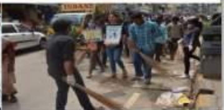
College students cleaning the streets