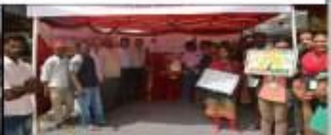
Students created awareness amongst the villagers through posters.