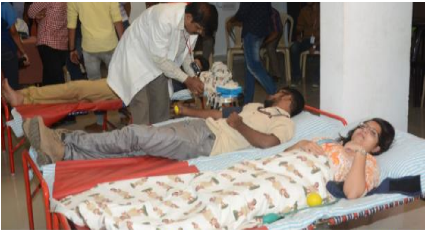
Blood donation camp at NEW HORIZON COLLEGE OF ENGINEERING

The professors of respective departments along with the principal took part in this great program organized by the college. The principal acknowledged the college authority and the college NSS Unit for such great initiative and said to have more such programs.