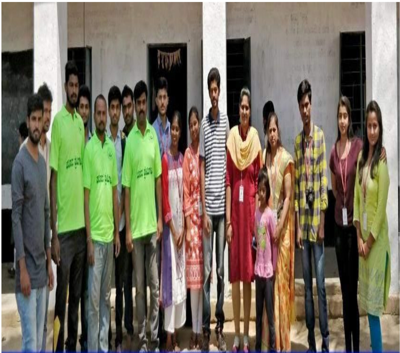
Departments Green Energy Club awarness campaign in Goverment school

The students were given tips on proper operation of refrigerators, air conditioners, televisions, household lighting and other household appliances. She also appealed to the students to stagger the use of water motors and other household equipment's to reduce the peak hour demand between 6 a.m. to 9 a.m. and 6 p.m. to 9 p.m.