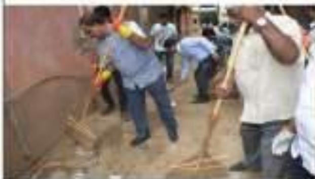
Govt officials and college staff cleaning the village premises