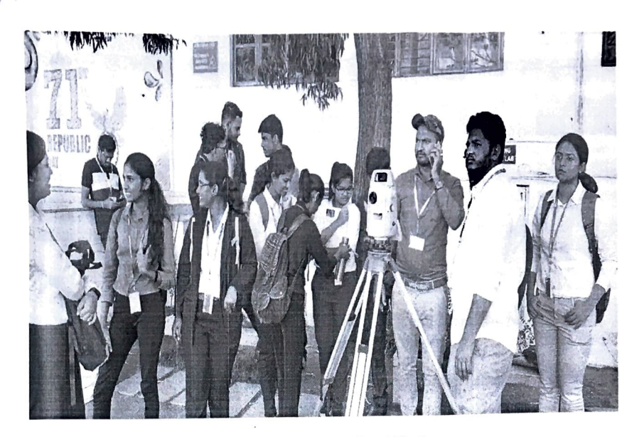
Hands on Training on Total Station