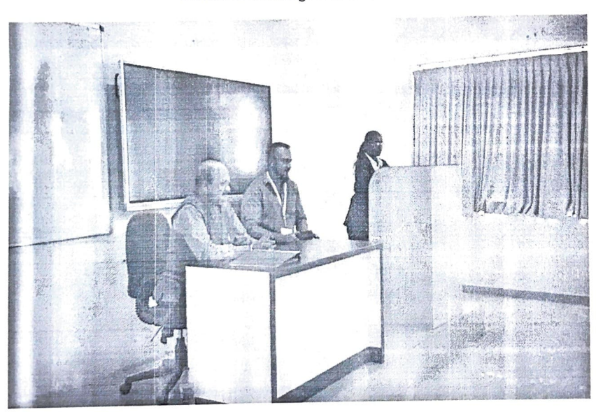
Students giving their feedback on the workshop